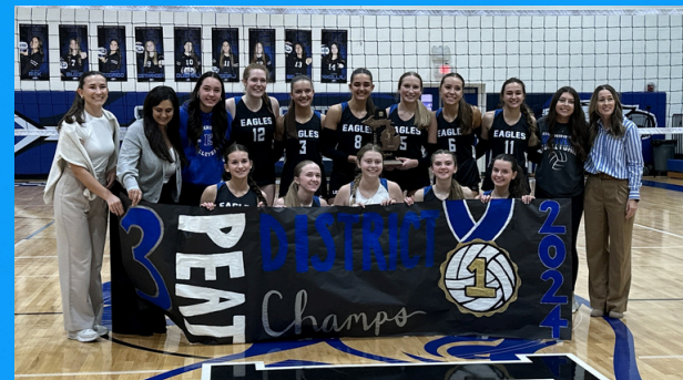
Congrats Volleyball District Champs!!!