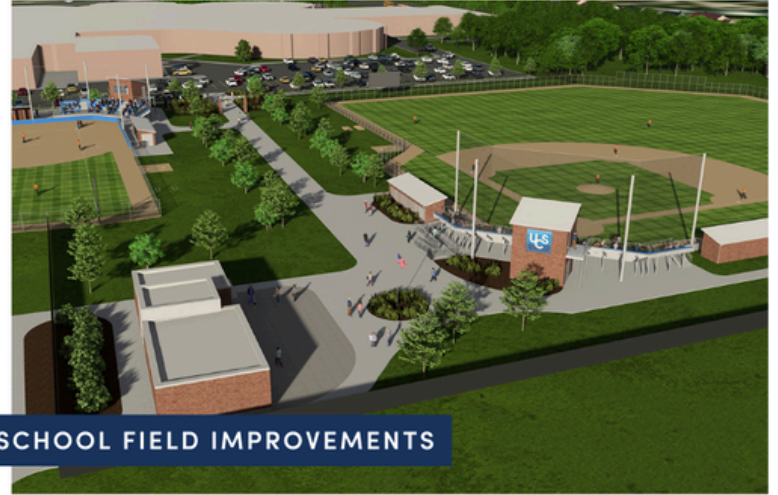
EISENHOWER HIGH SCHOOL FIELD IMPROVEMENTS